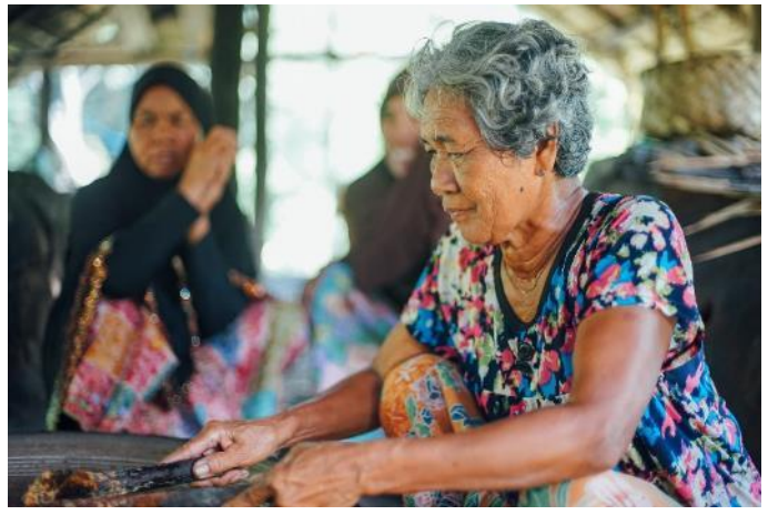
A member of "Palm Sugar Development Project" is making palm sugar after training by UNDP.

The project "Palm Sugar on Development and Branding" is located in Ban Thung and Ban Huakhlong, Panareh district, Pattani. Ban Thung Huakhlong and Ban are mixed communities, which are located in two adjacent sub-districts-Tha Kham and Ban Noak, respectively—in Panarae district. These two villages are relatively peaceful wherein Muslims and Buddhists still maintain close ties, in contrast to nearby villages, which