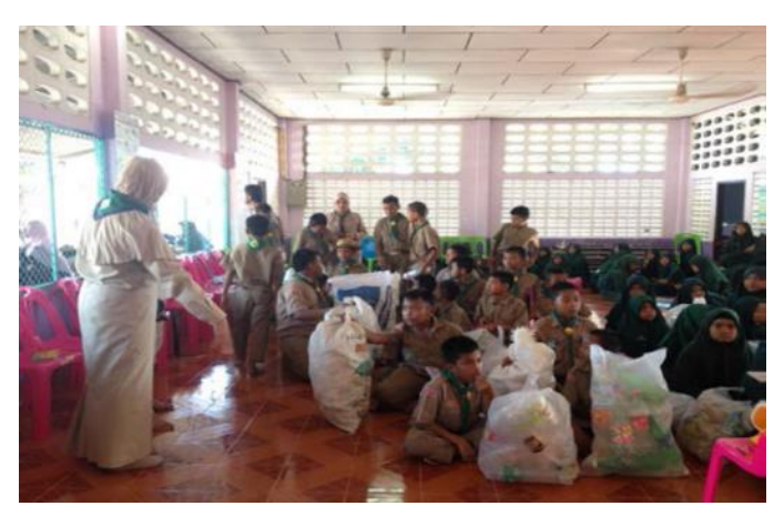
A teacher of Laem Pho school is guiding students on waste management

Laem Pho sub-district is a densely populated area with a population of approximately 9,000 in Yaring district, Pattani province. It is a Muslim community and became a touristic area in Pattani years ago. The survival of tourism in a conflict zone signifies that the area can still maintain some semblance of normalcy. Tourism provides an oasis amidst violent conflict and serves as an income-generating activity for those living in difficult