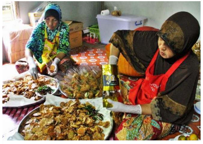
A member of UNDP-supported project at Gujingluepa is putting helbal fish crackers in newly-developed packaget

This project is located in Gujingluepa village, Ra-ngae district, Narathiwat. It comprises a group of 15 women who call their newly-established project the "Muslima KL Group." They hope their group and other villagers will be more secure in terms of economic stability in the hostile environment of the Deep South. Gujingluepa village became well known a teacher who left her home in the North to instruct children in the South was abducted from a local school. She died in 2007 after having been severely beaten by her abductors. Since then, Gujingluepa has been considered a dangerous area. Residents have been in constant fear and encounter difficulties of living, which affects their livelihoods and well-being.