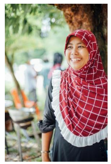
A member of "Dried and Fresh Fish Crackers" project in front of new equipment at Na Pradu sub-district

The group has been generating their product in functional areas of the factory and selling it in the local market. Even though it is not a direct conflict-affected group, members live in a conflict area, which limits the villagers' opportunities to travel freely, work without fear, and find jobs outside their village. Therefore, it is more sustainable for the members to have stable jobs by developing a community enterprise in the village. The group has been unemployed Muslim and Buddhist villagers to be part of production process. However, as Buddhists cannot be involved in the food production process, they are assigned to work on marketing.