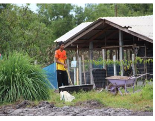
A member of Goat farming group is working in a project area

Experts invited from the university/universities trained the members to provide particular knowledge needed for goat farmers.