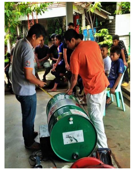
Youth is trained to produce energy saving oven at Lochut Sub-district community center

The project on "Energy Saving Oven and Charcoal Production" is located in Lochut sub-district, Waeng district, Narathiwat. Due to environmental problems and an energy crisis in the country, there has continually been an increase in prices of oil, gas, and electricity, despite the stagnant incomes of local people.