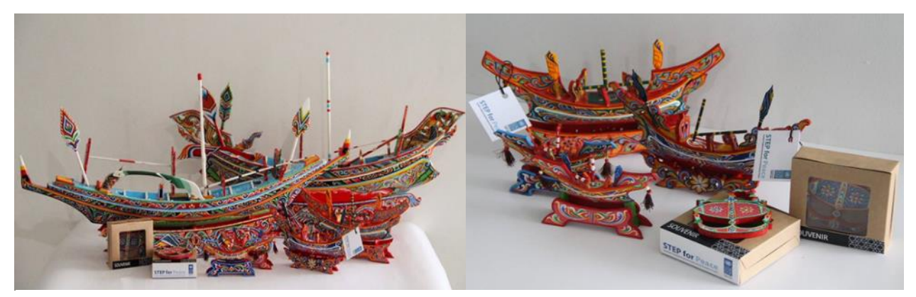
Handicraft made by youth of Ban Datoh who participated in UNDP project.