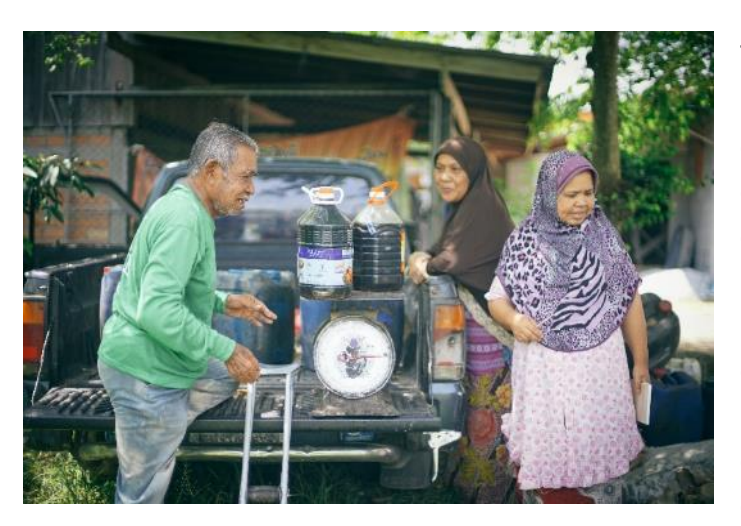
Member of Yala Bio-diesel Community Enterprise is collecting cooking oil

The Yala Bio-diesel Community Enterprise is located in Lam Mai subdistrict, Muang District, Yala. It was established in 2009 amid growing concern for the environment and an increased awareness of energy crisis. Bio-diesel is an alternative form of energy refined from used cooking oil. Because it is recycled, bio-diesel energy is conserves and less detrimental to the environment than other fuel sources. Furthermore, biodiesel production discourages