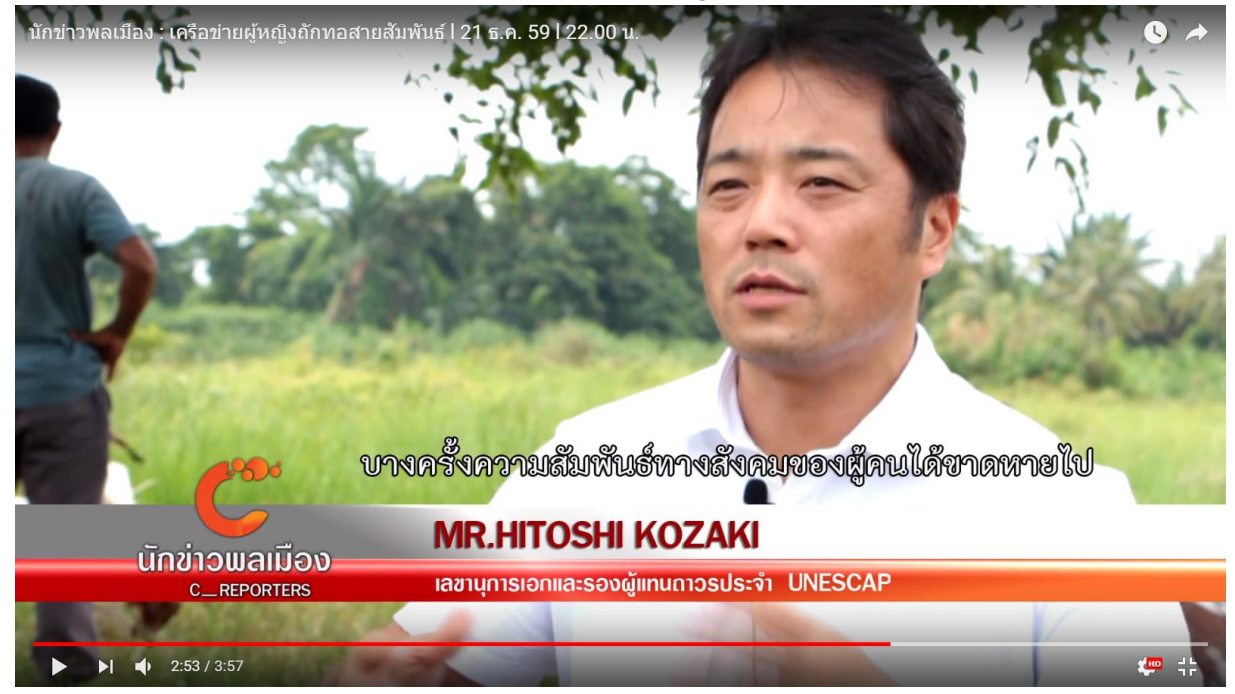
Thai PBS News on support of the Government of Japan to livelihood improvement project.

News programme on small grants. Ten out of thirteen successful community projects, staff from the Embassy of Japan in Bangkok and UNDP staff were interviewed and filmed for a documentary. Thai Public Broadcasting Service channel (Thai PBS) broadcast the ten video documentaries of ten out of thirteen successful communities on the citizen reporter programme during 2016-2017. Social media channels such as Facebook, YouTube, and many more also disseminated the documentary to raise awareness among people who live outside the southern province and keep them updated on regional news.