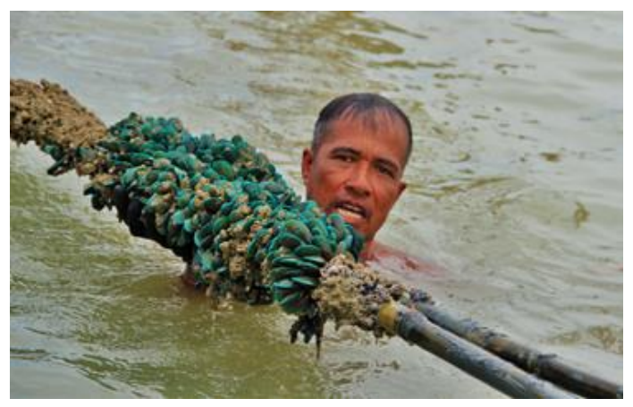
A member of Mussel Farming group shown a bunch of mussel

from the Fisheries Department, Faculty of Science and Technology, PSU, Pattani Campus with a starting membership of 20 fishermen.